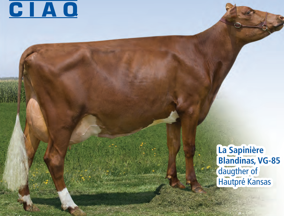
La Sapinière Blandinas, VG-85 daughter of Hautpré Kansas